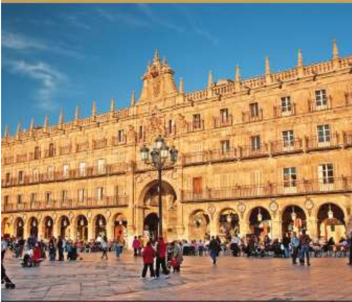
Feel the rhythm of the city in the Plaza Mayor, Salamanca, Spain