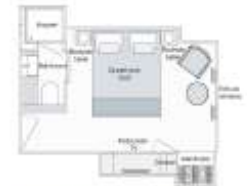
Emerald Stateroom between 153ft 2 - 170ft 2 E D