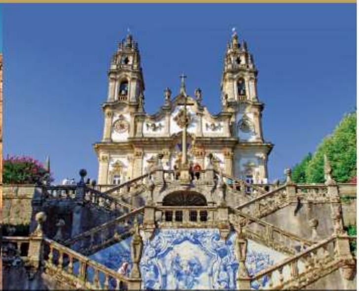
Tile work adorns the Sanctuary of Our Lady of Remedies, Lamego, Portugal