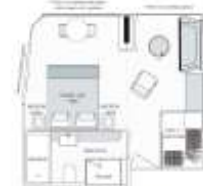
Emerald Riverview Suite 300ft 2 BA