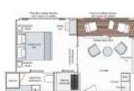
Owner's One-Bedroom Suite 285ft 2 SA