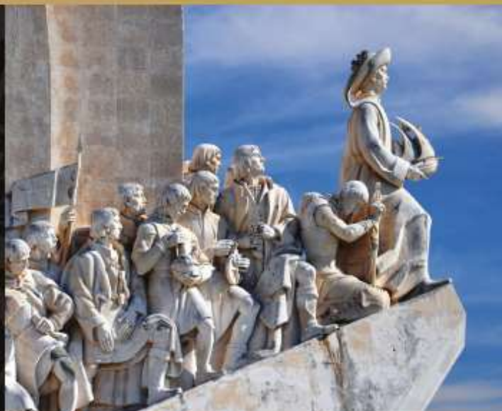
Monument to the Discoveries overlooks the harbor in Lisbon, Portugal

Days Four through Ten – Aboard the MS Emerald Radianca