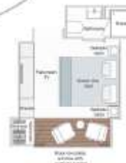
Panorama Balcony Suite 188ft 2 - 160ft 2 P A R B C