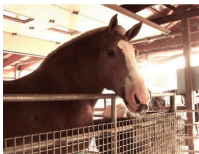
Big Ben, 3006 lb. Belgium Draft Horse

GREAT DAY! TOURS & CHARTER BUS SERVICE . . . (440) 526-5350 . . . (800) 362-4905