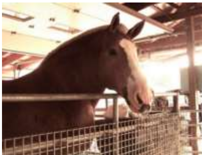
Big Ben, 3006 lb. Belgium Draft Horse