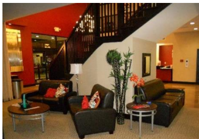
The beautiful Berlin Grande

Deposit to book, $100 per person; we accept all major credit cards and checks. Tours can now be booked on-line, 24 hours a day with a credit card.