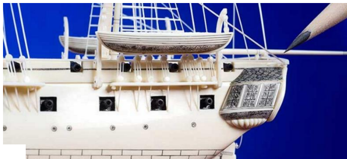
Even the ropes are carved from ivory