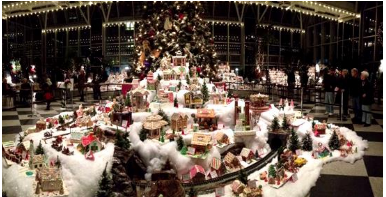
Gingerbread houses and trains for the holidays