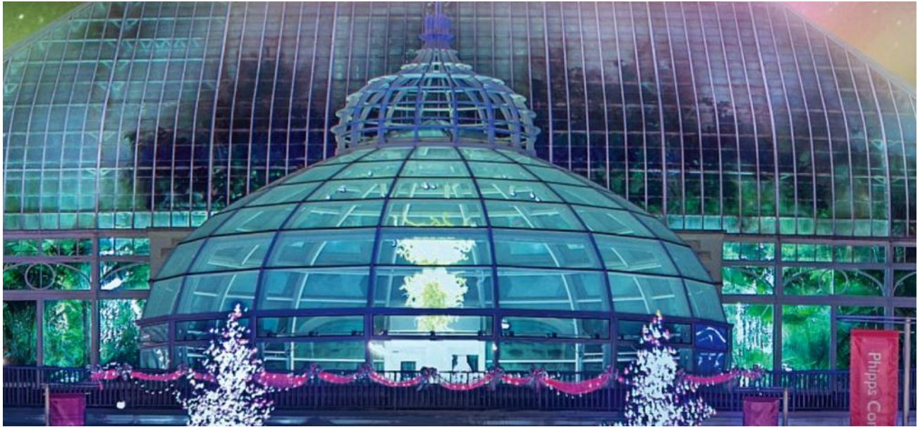
Phipps Conservatory & Botanical Gardens