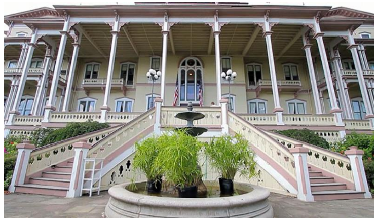
Athenaeum Hotel, Our Choice for Luncheon On the grounds of the Chautauqua Institution

This year we’ve taken suggestions, modifying the itinerary so that we spend more time at the village . . . and at the same price for the third consecutive year.