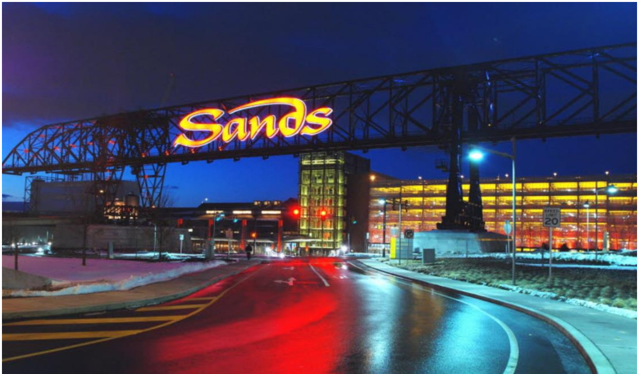
Sands Casino Resort

MONDAY – Sands, Lehigh Valley – We will depart and travel across I-80 through Pennsylvania, with a morning rest stop as well as a lunch stop midday. Upon our arrival we will be checking into the Sands Casino Hotel where we will be staying all three nights – just one check-in and one check-out for your convenience. This new hotel was built and opened at the time that the old Atlantic City Sands Casino Hotel was demolished. Here, you will be receiving the first of your bonuses, two $20 food vouchers, one $5 food voucher and $80 in free slot play ; all passengers must be at least 21. There are a number of restaurants to select from including Emeril's Italian Table Restaurant. You'll have time to rest, relax and enjoy all that this beautiful casino has to offer.