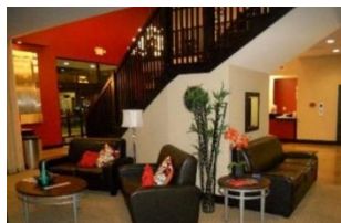
The beautiful Berlin Grande

Tours can now be booked online, 24 hours a day with a credit card.