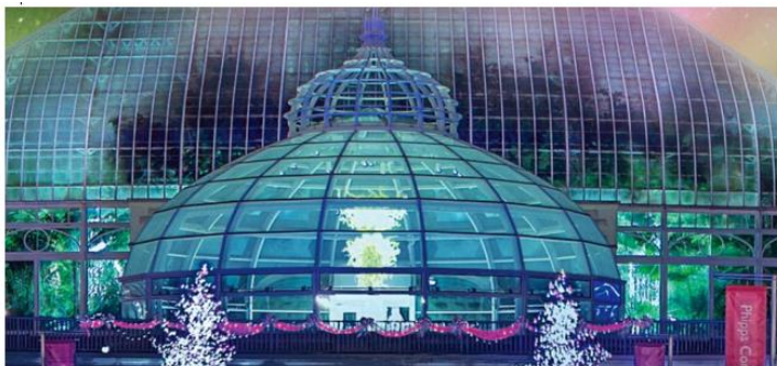
Phipps Conservatory & Botanical Gardens