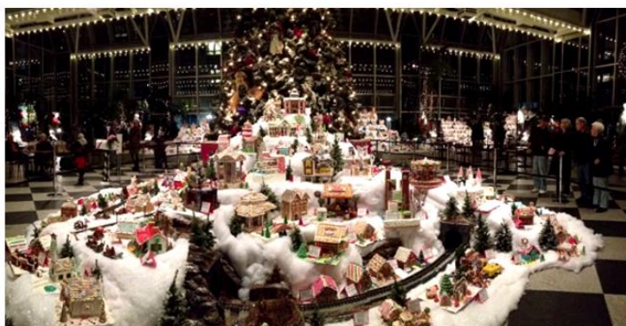
Gingerbread houses and trains for the holidays

We will also be visiting Phipps Conservatory & Botanical Gardens; set in Schenley Park, it's a complex of buildings designated Historic Landmarks, with Victorian architecture.